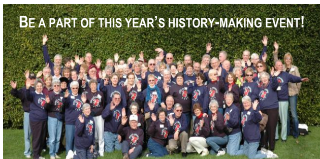
ENJOY DECORATING SOME OF THE MOST MEANINGFUL AND INSPIRATIONAL FLOATS INCLUDING THE ONLY CHRISTIAN-THEME FLOAT IN THE PARADE!

Or, contact LutherTours for assistance with your online registration.