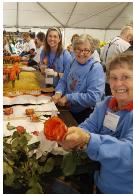
ENJOY A FULFILLING DAY OF DECORATING SOME OF THE MOST MEANINGFUL AND INSPIRATIONAL FLOATS INCLUDING THE ONLY CHRISTIAN FLOAT IN THE PARADE!

WELCOME BACK TO TRAVEL SAVINGS OFFER REGISTER BY JULY 30 AND SAVE $200 EACH