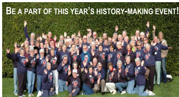
BE A PART OF THIS YEAR'S HISTORY-MAKING EVENT!

Click the link at the bottom of the detail page to submit your registration and $350 per person credit card deposit. Or, contact LutherTours for assistance.